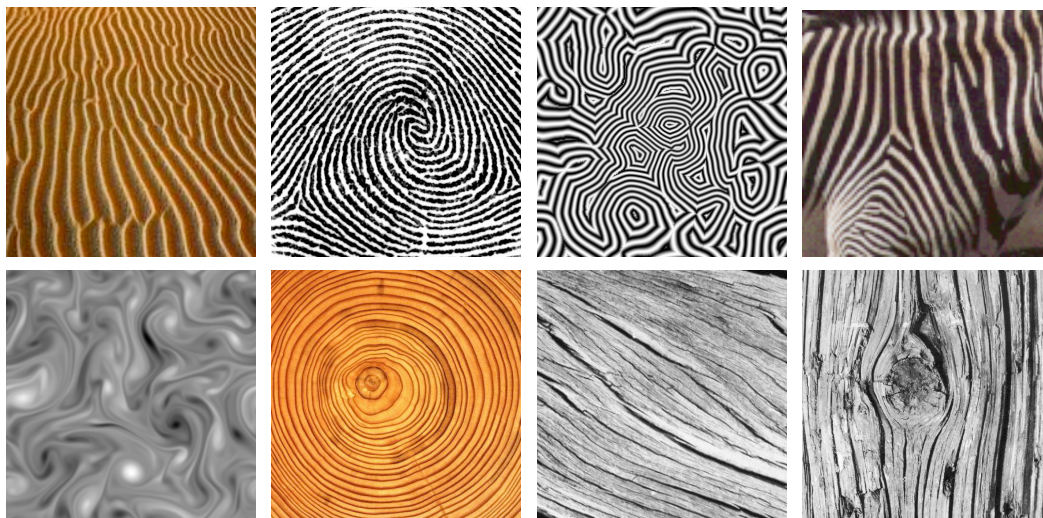
Figure 2: Examples of natural and synthesised oriented oscillating patterns from Peyré [70].

Sound design is the wider context of creating interaction sounds, sound scapes, and sound textures. Literature in the field often contains useful methods for sound texture design [10, 14, 58–61].