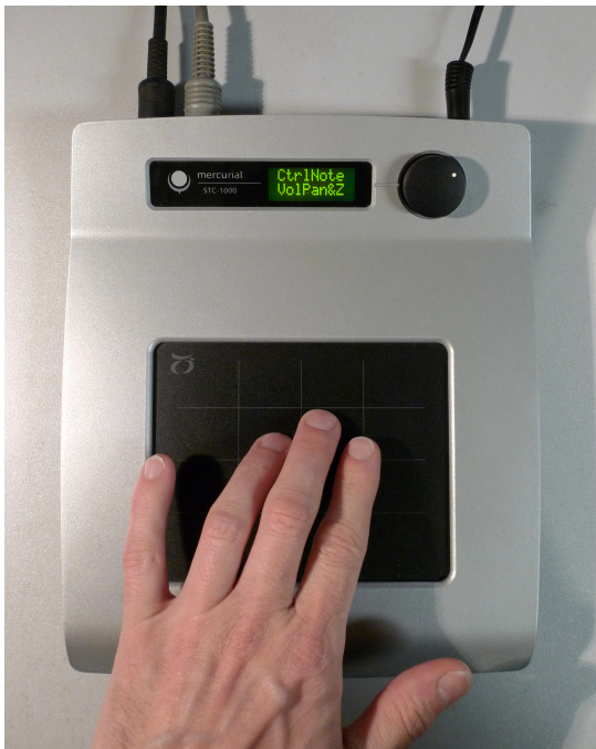
Figure 2: The Mercurial STC-1000 XY+pressure MIDI controller.

The Mercurial Innovations Group STC-1000 MIDI controller, now no longer produced, has a Tactex surface with a grid of 3x3 pressure sensors. Using SysEx, one can make it send the raw 1024 bit pressure data, and recalculate the position with higher precision as the standard output via the center of gravity of the pressure values. One can also determine the size of the touched area, given by the standard deviation. This allows to control one additional parameter by the distance between two fingers. See video example 4.1.