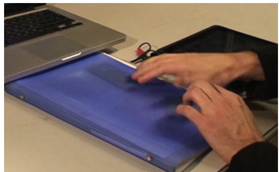
Figure 3: Piezo microphones under a corrugated plastic folder, allowing to hit, scratch, and strum a corpus.

The attack detection is not 100% accurate, but since the signal from the piezos is mixed to the audio played by CATART, the musical interaction still works.